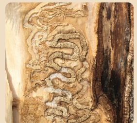
S - Shaped Galleries