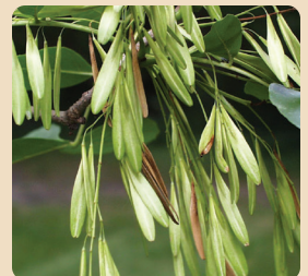
Paddle Shaped Seeds