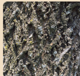
Diamond Shaped Bark