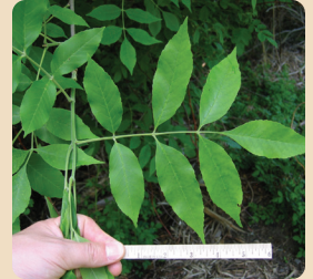
Compound Pinnate Leaves