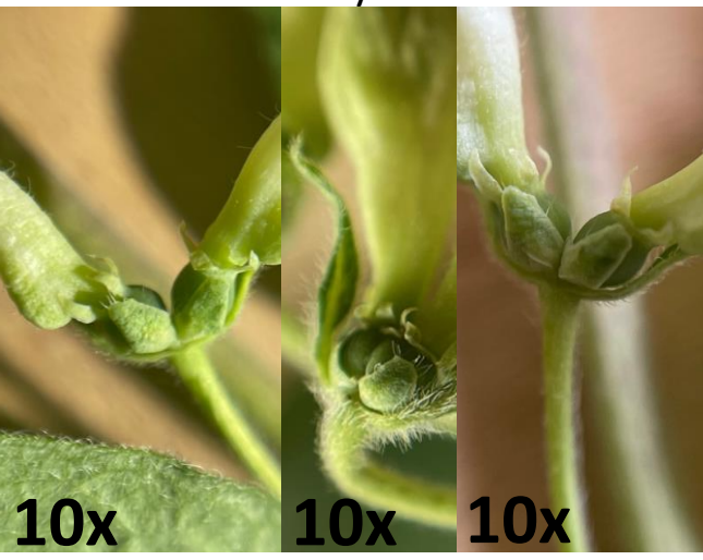
If yes, not L. maackii, nor L. tatarica

Bractlets "at least half as long as the ovaries they subtend"