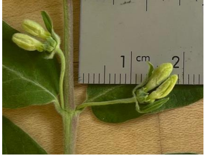
If yes, not L. maackii

Pubescent leaves, petioles, twigs, peduncles