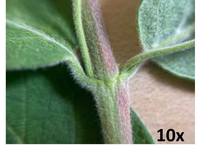
If yes, not L. tatarica

Pubescent leaves, petioles, twigs, peduncles